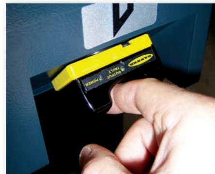
Challenge Exclusive Ergo-Touch Button System (optional)

Along with all the other ergonomic features, Challenge's EXCLUSIVE Ergo-Touch Cut Button option provides protection from one of the most repetitive movements required of a cutter operator - the continual pressing of the cut buttons during the cut cycle. The Ergo-Touch cut button system requires the same dual handed interaction from the operator but does not require him/her to hold in place spring pressured buttons. This system only requires that the operator's finger be present in each cut switch device during the cut cycle providing ergonomic relief on the operator's hands and wrists.