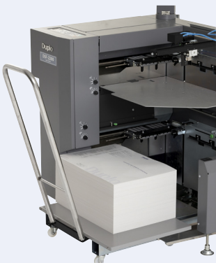
PRE-LOADING KIT allows operator to pre-stage and align the paper prior to loading.