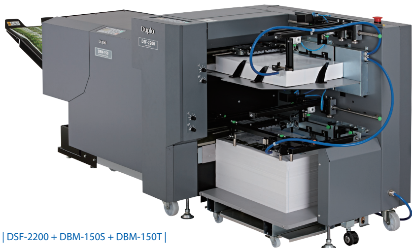
| DSF-2200 + DBM-150S + DBM-150T |

Equipped with the Isaberg Rapid stapler and staple cartridge, the DBM-150S Bookletmaker produces a high quality, flat staple every time. Each cartridge holds 5,000 staples and wear parts are replaced each time the cartridge is changed out, providing a high level of reliability. The DBM-150S produces corner and side-stapled applications as well as saddle-stapled and folded booklets up to 1,720 booklets per hour. In addition, booklets can be face trimmed by adding the optional DBM-150T Trimmer.