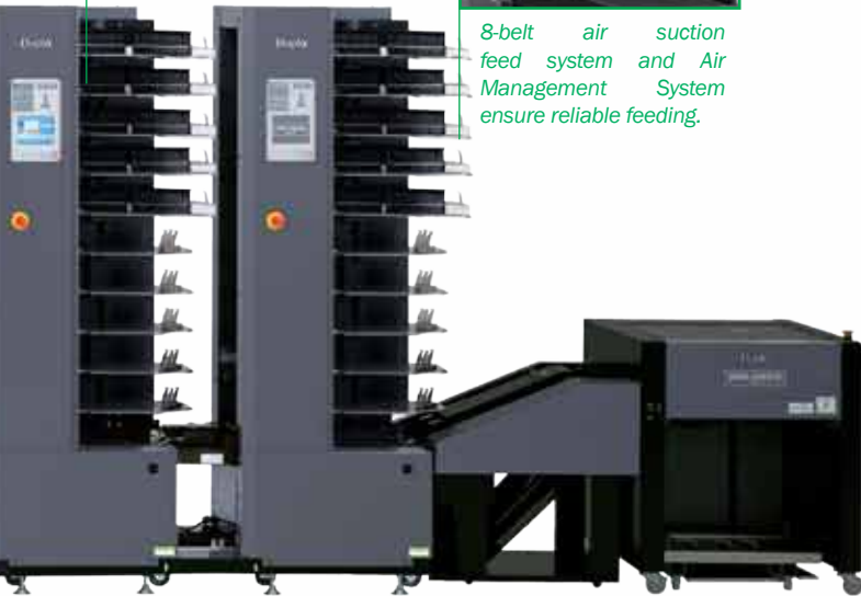
DSC-10/60i Suction Collators

8-belt air suction feed system and Air Management System ensure reliable feeding.