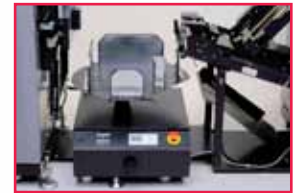
DCR-ST Cross Stacker