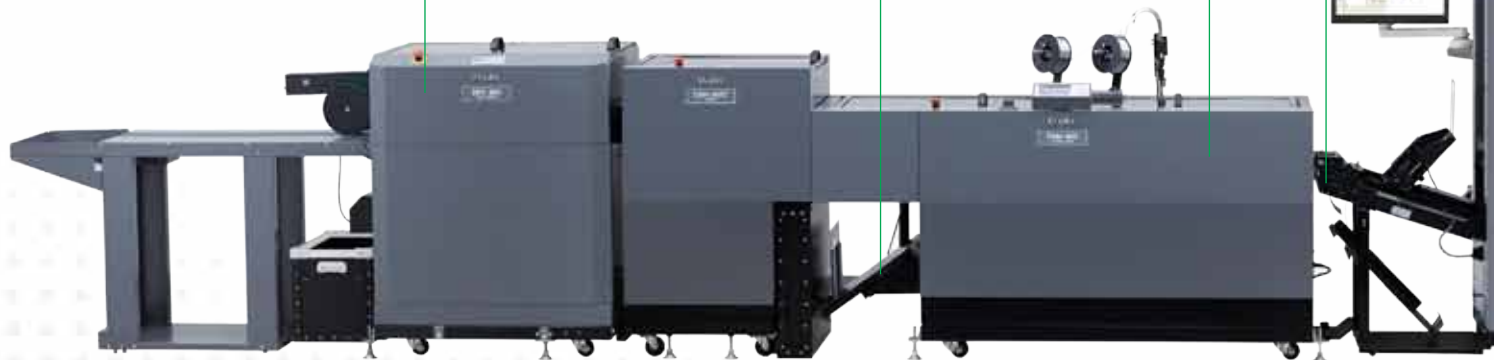
DBM-LSW Long Stacker