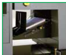
Lower Stack Tray makes switching from saddle stitch to corner or side stitch quick and simple.