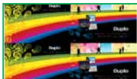
Process 2-up applications with the DKT-200 and gutter cutter option.

Users can connect up to 6 towers for a maximum of 60 bins. Divide the bins into 1/2, 1/3, and 1/4 blocks to allow reloading without having to stop or interrupt production. Use the Interleaf mode to insert one or two sheets between a specified number of sheets or control each bin individually by using the IMBF feature.