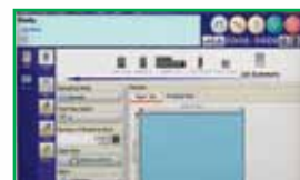
Create and save jobs as well as control the entire system from a PC or laptop using the intuitive PC Controller software.