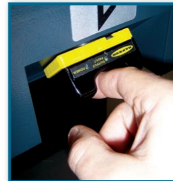
Challenge Exclusive Ergo-Touch Button (optional)

Challenge's EXCLUSIVE Ergo-Touch Cut Button option provides protection from one of the most repetitive movements required of a cutter operator - the continual pressing of the cut buttons during the cut cycle. The Ergo-Touch cut button system requires the same dual handed interaction from the operator but does not require him/her to hold in place a spring pressured button. This system only requires that the operator's finger be present in each cut switch device during the cut cycle providing ergonomic relief on the operator's hands and wrists.