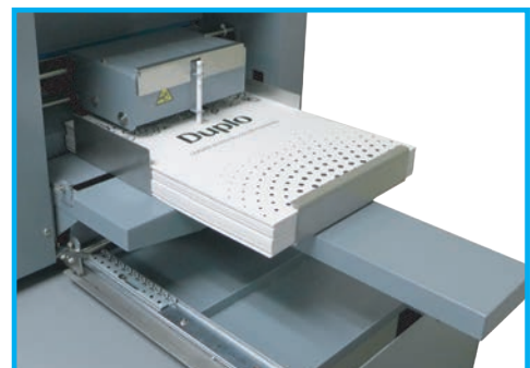
Automatic sheet feeding system