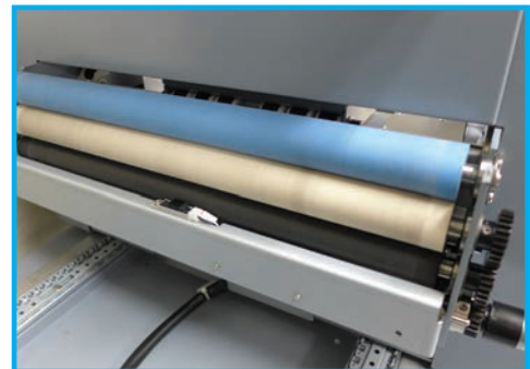
Dust and de-curling rollers keep sheets flat