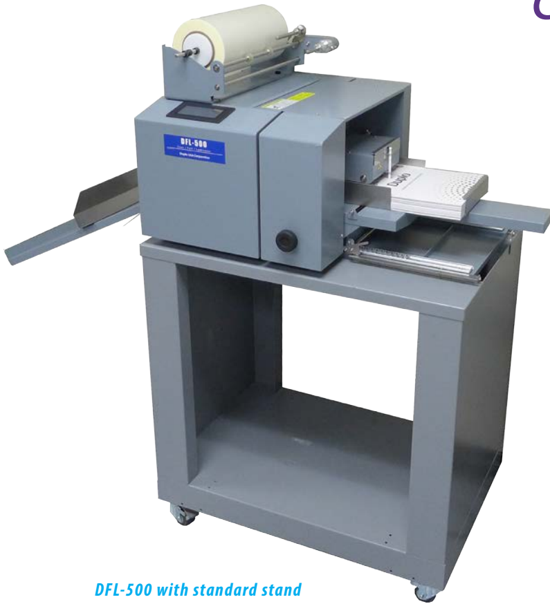
DFL-500 with standard stand