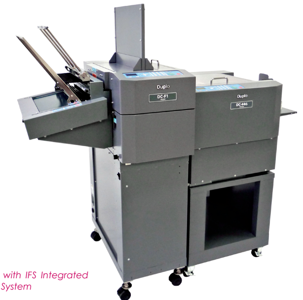
DC-446 with IFS Integrated Folding System