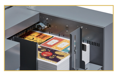
AIR SUCTION FEED AND SHEET ALIGNMENT SYSTEM