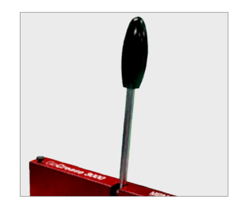
ERGONOMIC BAR Ergonomic bar for easy creasing with minimum use of force.

5230 Finch Ave. E., Unit 6 Toronto, ON M1S 4Z9