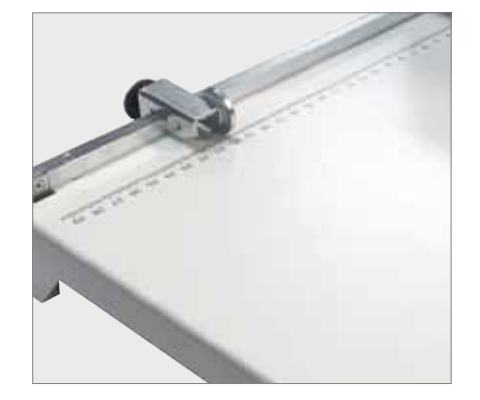
SIDE GUIDE Side guide with skew adjustment for ease of use.