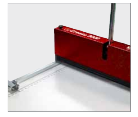
SIDE ADJUSTMENT Side adjustment wheels for quick exchange of paper position.