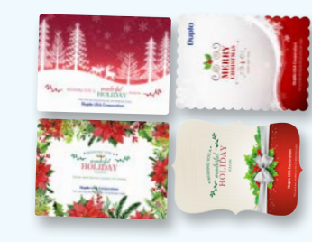
die cut pieces